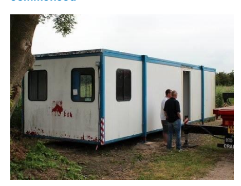
Members of the Hull and District Anglers Association who helped to renov ate the portacabins

The original condition of the portacabin before work commenced