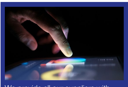
We provide all our suppliers with access to the assessment tools we have developed for identifying and combatting exploitation in supply chains. These are made available on our supplier webpage.

We will be monitoring this project closely and as our knowledge about modern slavery or exploitation risks develops, we will address them during this project and transfer learning and mitigations to other similar projects.